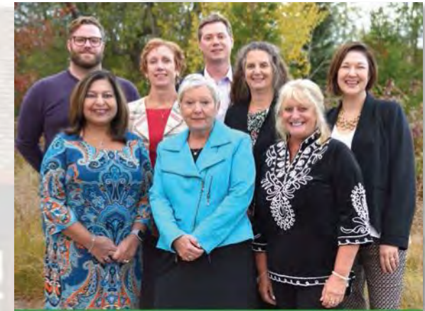
Bethell Hospice, Board of Directors 2019/2020