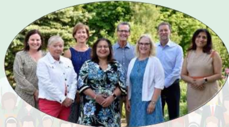
Bethell Hospice Board of Directors, 2022/2023